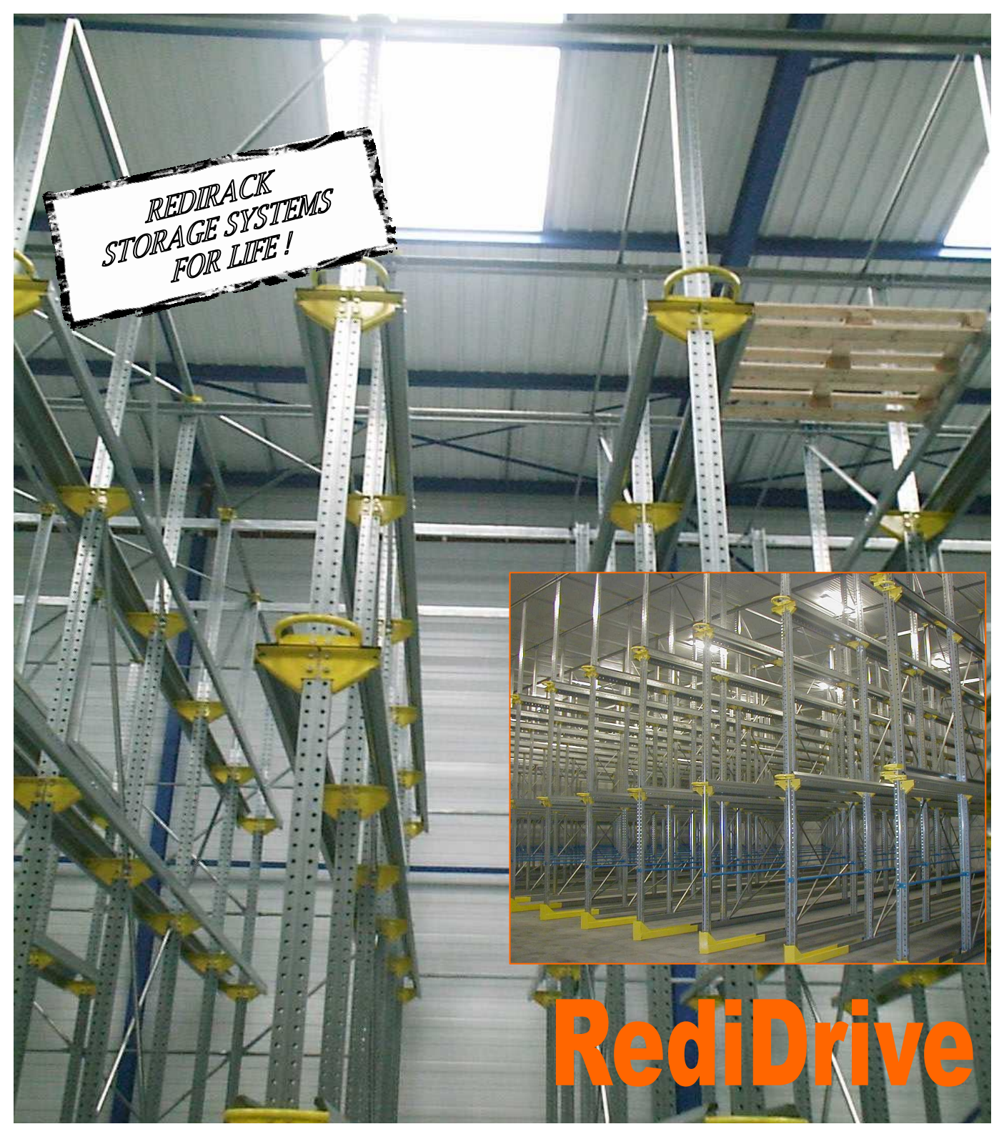
Redirack is manufacturer of storage systems since 1952 (CORNIX group)