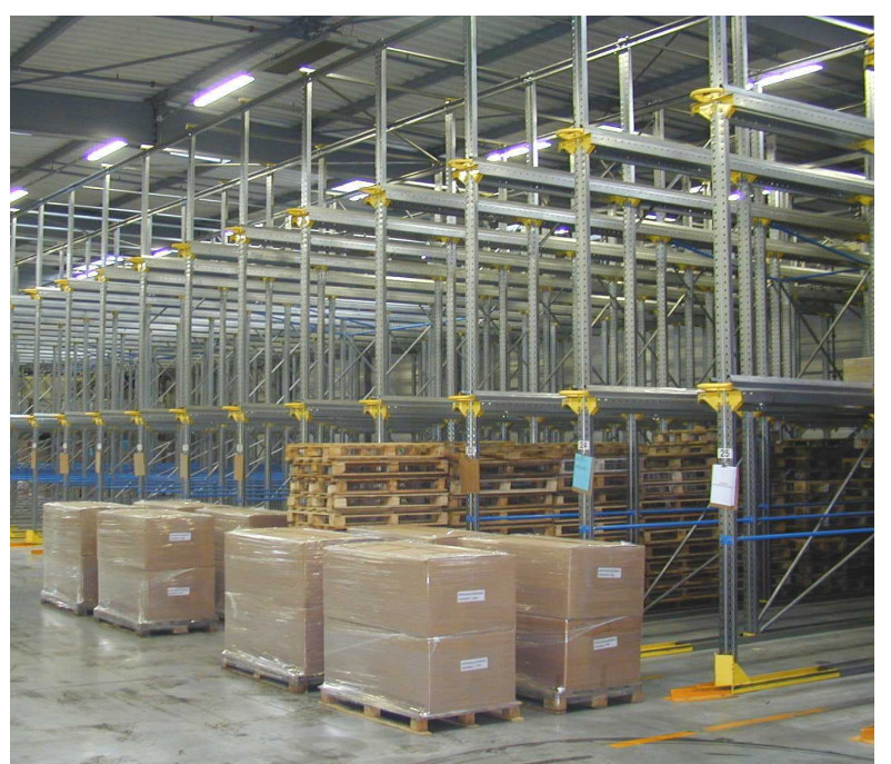
Our engineers are at your disposal to make a free quote based on your requirements. Consult us !

Delivered not assembled. On request our specialized installers will install your drive-in. Ask for a free quote !